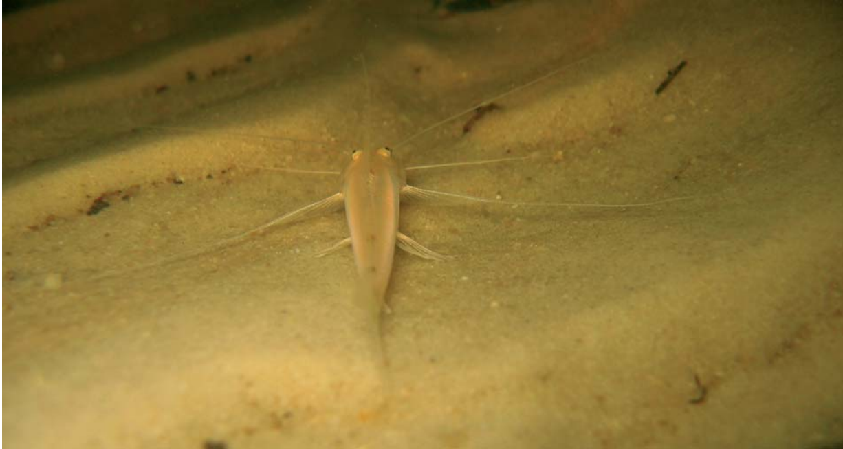
Fig. 2. The sit-and-wait foraging posture of Mastiglanis asopos in posterior view. Note very long barbels and filamentous rays of pectoral fins spread in a drift trap-like device, as well as the alignment of mentonian barbels and pectoral filaments.

was to catch drifting prey close to the bottom (“bottom drift-feeding”).