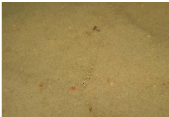
Fig. 4. The minute and translucent Stauroglanis gouldingi (not preserved) poised on the sandy stream bottom.

vae (ingested with the sand cases) and ephemeropterans constituted a considerable portion of the gut contents of Mastiglanis asopos . Crustaceans were poorly represented in the stomachs of the five species and a dragonfly nymph occurred in a single G. rondoni specimen. Sand grains were found in the guts of all species but fine sediment occurred only in the stomach of G. rondoni and “ Imparfinis ” pristos .