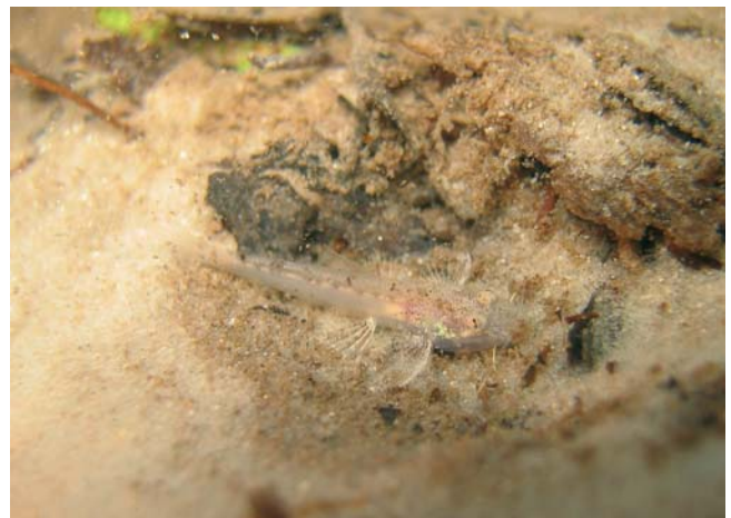
Fig. 3. The sit-and-wait foraging posture of “ Imparfinis ” pristos in dorsal view. Note translucent body and comma-shaped pupil.

Major food types. Bottom-dwelling, aquatic immature insects (mainly chironomid and ceratopogonid larvae) were the staple food for all five psammophilous fishes (Table 1). Coleopteran larvae (mainly Elmidae) were an important food item for Gymnorhamphichthys rondoni , whereas small trichopteran lar-